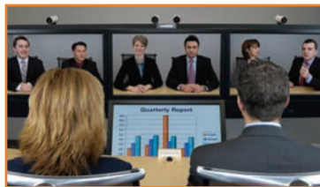
NEW YORK: TANDBERG EXPERIA™