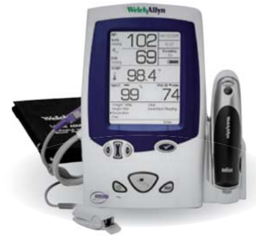
Spot Vital Signs® LXi

Works with your PC or Mac and on most popular video codecs including: